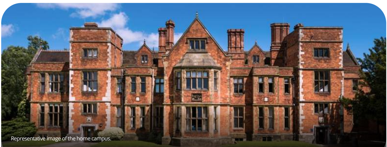
Representative image of the home campus.